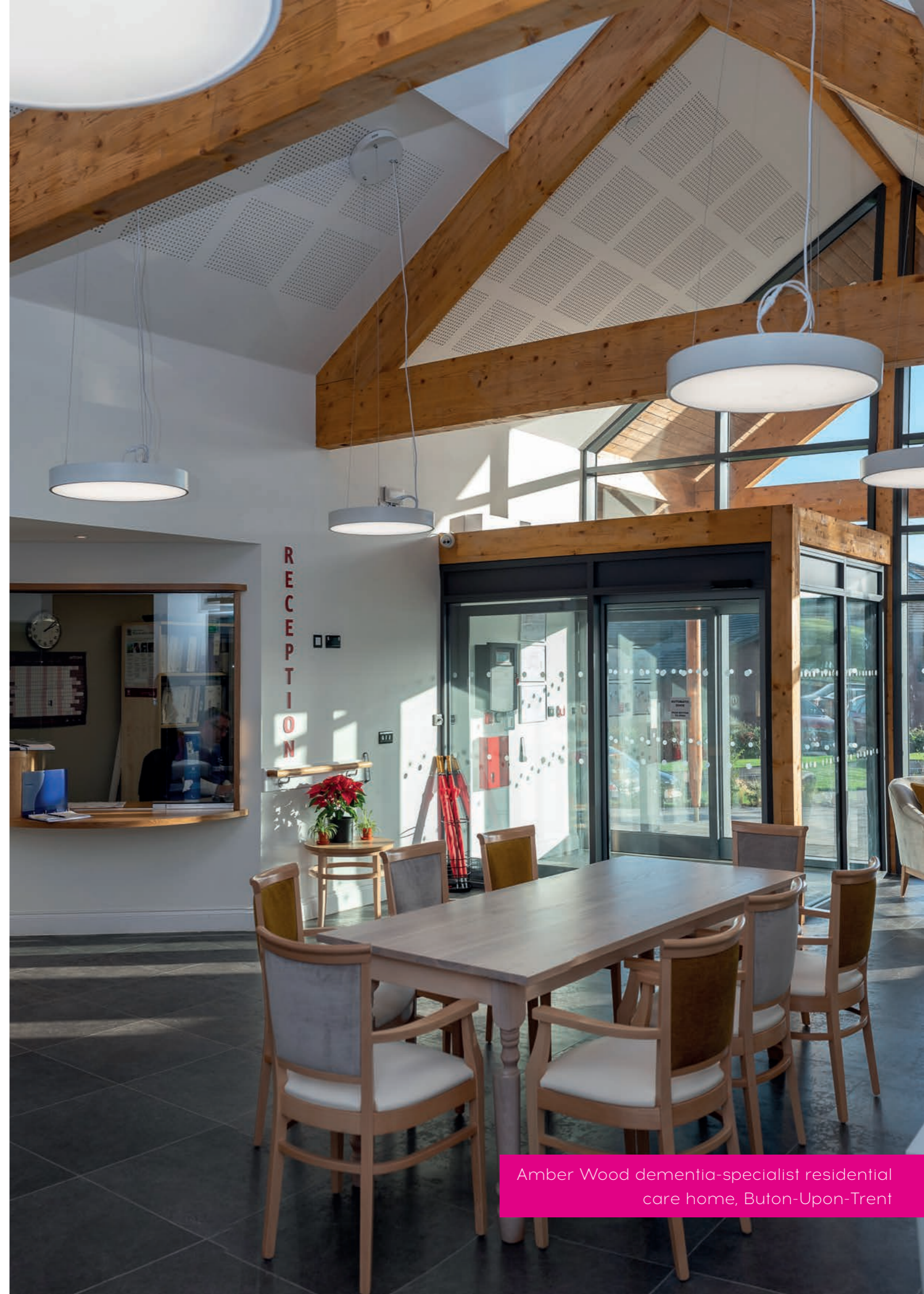
Amber Wood dementia-specialist residential care home, Buton-Upon-Trent